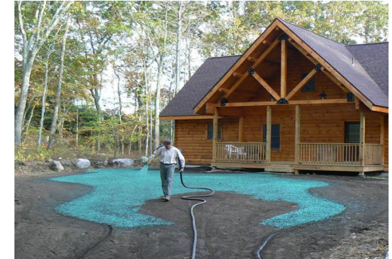
Residential • Commercial • Athletic Fields